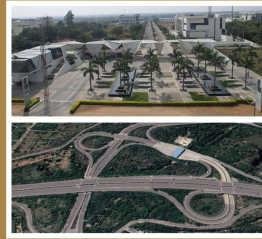
Outer Ring Road